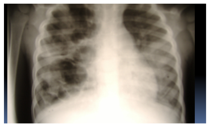
Figure 6 Note multiple patchy infiltrates and pneumatoceles suggestive of a Staphylococcus aureus aetiology

agents like amoxicillin-clavulanate (Augmentin®), or sultamicillin (ampicillin-sulbactam combination), their use is becoming increasingly inevitable for the moderate to severe cases of pneumonia, particularly in the urban tropical paediatric practice. Parenteral aminoglycosides like gentamicin may be combined with any of these semisynthetic penicillins, not only with synergistic efficacy for Gram-positive pathogens, but for an equally effective coverage of a possible Klebsiella pneumoniae aetiology. In the penicillin-allergic patient, parenteral cefuroxime is a suitable substitute. Alternative antimicrobial agents for