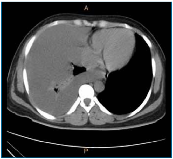
Figure 2. Non-contrast enhanced chest CT scan at second menstrual period showing right haemothorax with marked compression of the lung.

at which time the chest radiograph revealed no pleural effusion. Subsequently, she remained asymptomatic. Hence, a retrospective clinical diagnosis of thoracic endometriosis was made.