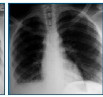
Figure 1 (a)