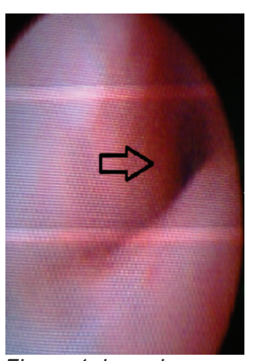
Figure 1 bronchoscopy showing severe

cheal cough and poor response to steroid flexible bronchoscopy was done. It showed slit-like narrowing of the lower third of the trachea with external pulsation and complete obstruction on expiration, as shown in Figure 1. There were no complete tracheal rings. CT angiogram showed pulmonary sling with severe compression of the trachea as shown in Figures 2 and 3. She underwent re-implantation of the left pulmonary artery and aortopexy and extubated on the second day. Her symptoms narrowing of the lower on follow-up disappeared com- third of the trachea pletely and inhalers were no (black arrow) longer required.