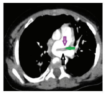
Figure 2 CT-angio showed the left artery pulmonary artery (black arrow) behind the trachea causing severe compression (green arrow). Right pulmonary artery shown in purple arrow.